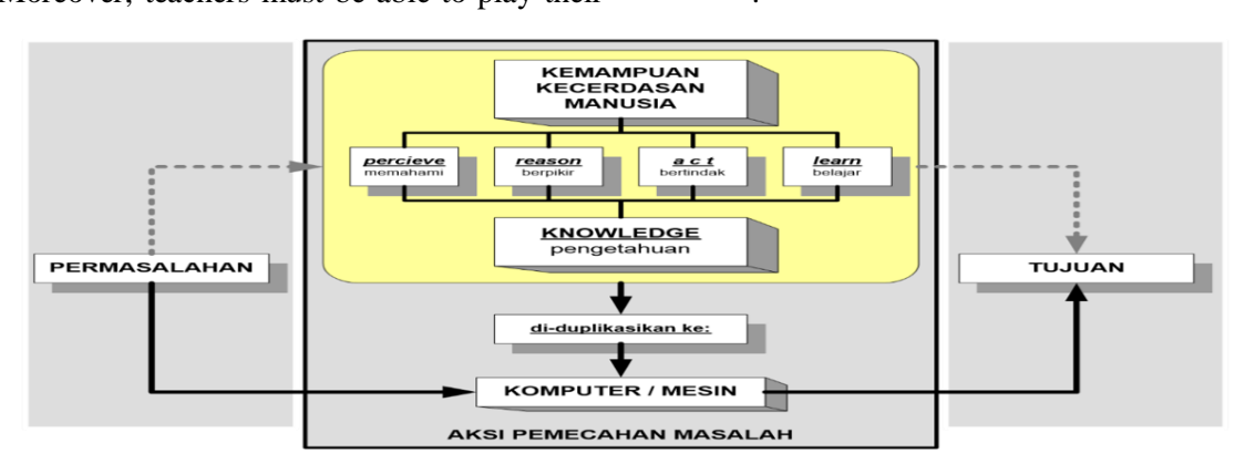
Figure 6. Simple view of Artificial Intelligent (AI) systems

Additionally, people can learn to use a variety of ways and various sources in the present time. It is a challenge for teachers to find approaches that will be applied in helping students to learn effectively. Teachers, in the digital age, need to understand about the way their students learn and find the best among various choices. It means that as long as teachers do not understand how the abilities, needs and strengths of each student in learning something, it will be difficult for teachers to determine learning and teaching method, whereas it will give a positive impact for their students. Artificial Intelligent (AI) components can be utilized by the teacher in learning. Here is the simple viewpoint of AI's system (Kresnanto, 2018).