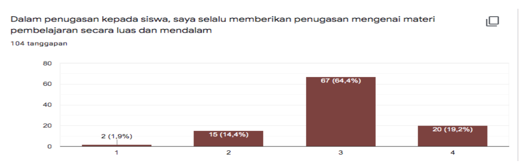
Figure 5. The use of learning materials in assignments

on the results of the survey, most teachers do not always assign learning material widely and in depth.