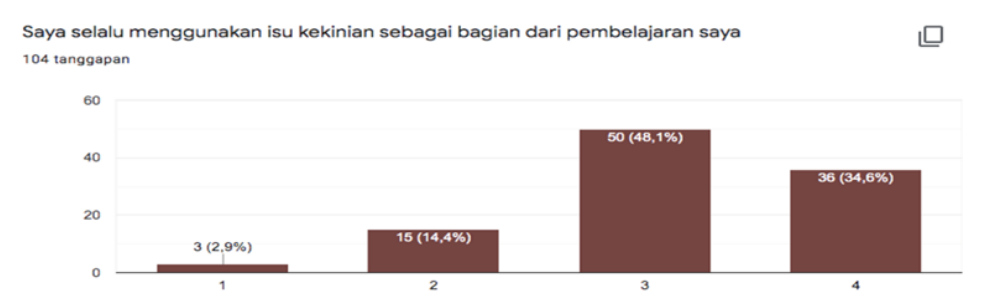
Figure 4. The use of contemporary issues in learning

34.6% (never). Based on the results of the survey, most teachers do not always and never use current issues in learning.